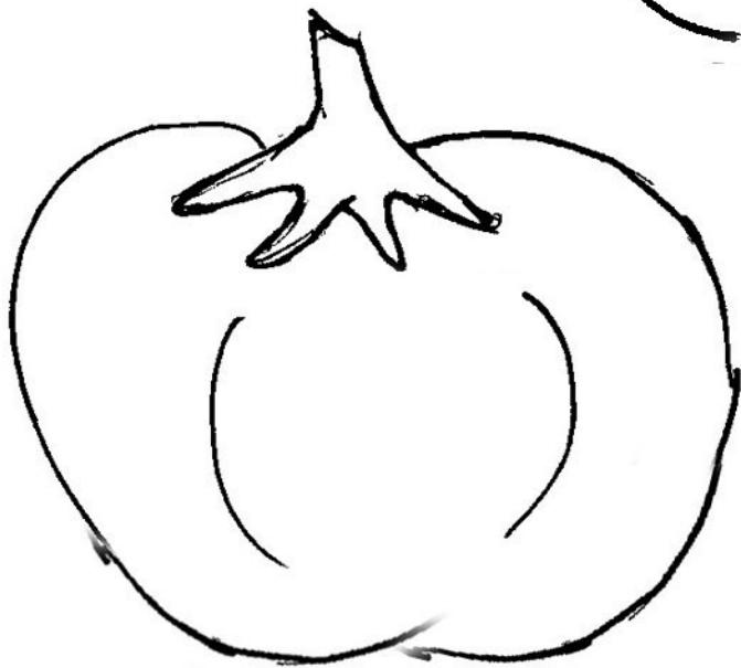
Red Tomato Green top